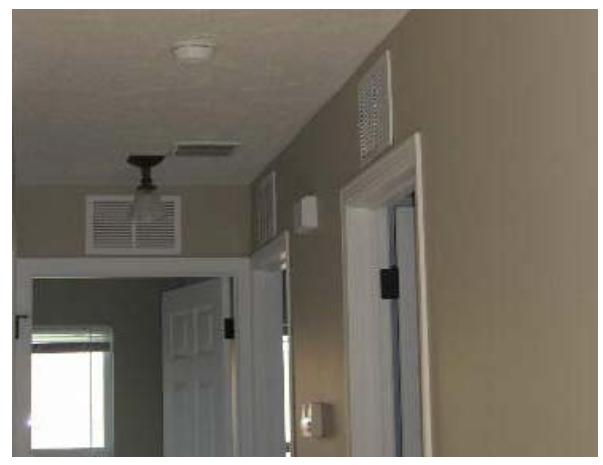
Finished House with Transfer Grilles