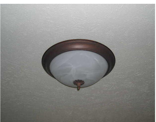
Bedroom Ceiling Fixture Pin-Type Fixture (see photo on right)