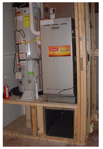
Bryant Plus 90

Another requirement of the Nebraska Certified Green Building Homes Program is a minimum Seasonal Energy Efficiency Rating (SEER) of 12 for the air conditioning system. Typically, SEER 10 equipment is installed in affordable housing. The 1.5 Ton Bryant condensing unit (Model 533GN 018) uses R-410A (Puron) refrigerant. R-410A refrigerant is chlorine-free.