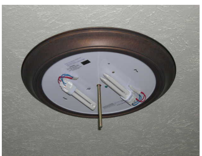
Typical for 2 Secondary Bedrooms (2) 26 Watt Pin-Type CFLs