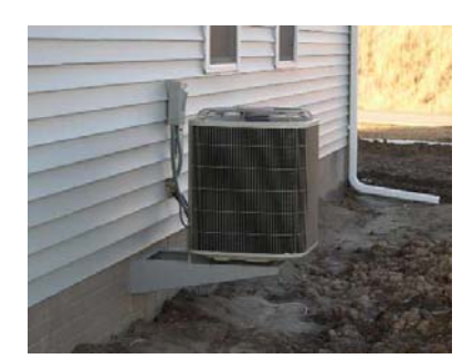
1.5 Ton Condensing Unit Page 20 of 33