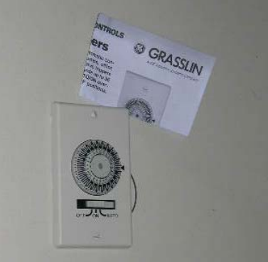
Upgrade Fan & Timer