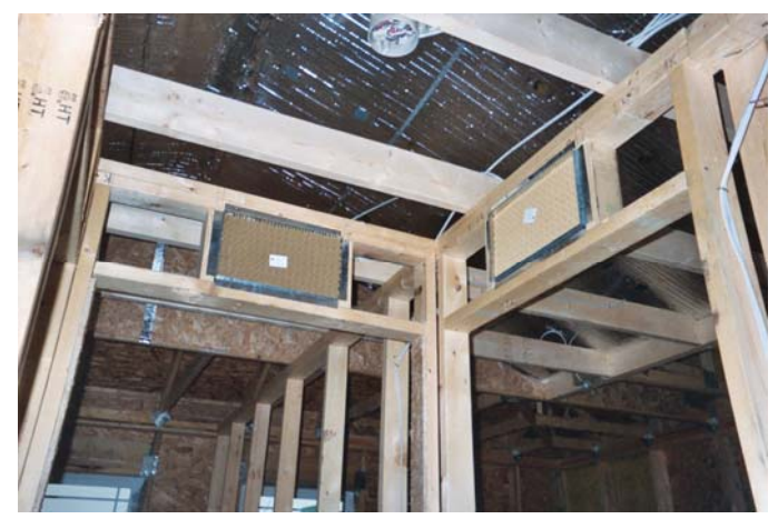
R.A.P. Transfer Grilles with baffles exposed

To provide a well-balanced air distribution system, this home combines a single low central return with transfer grilles over each bedroom door. The mechanical equipment is located in a closet off the main hallway in the center of the plan. CARB specified Return Air Pathway (R.A.P.) Transfer Grilles, which have a baffle to reduce noise and light transmission. Under the Nebraska Certified Green Building Homes Program, the home receives credit for using transfer grilles in every "enclosed livable room".